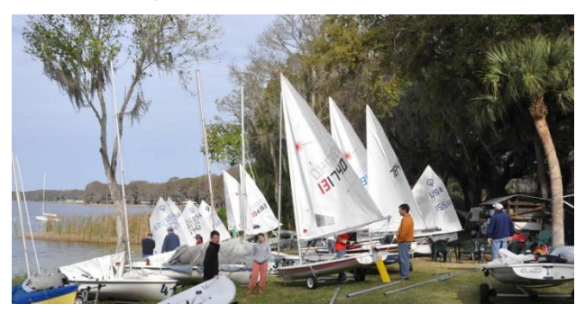
Optis, 420s and Lasers prepare for racing on the Sam Chapin Beach at LESC.

Forty-one Flying Scotts, 21 from LESC, populated a 1000 foot starting line, a remarkably beautiful site. Also visible on the lake, on a smaller course to the south and east, were the Lasers, Optis and 420s. Waiting to start after and on the same course as the Flying Scotts provided an almost 360 degree view of sails. Stunning!