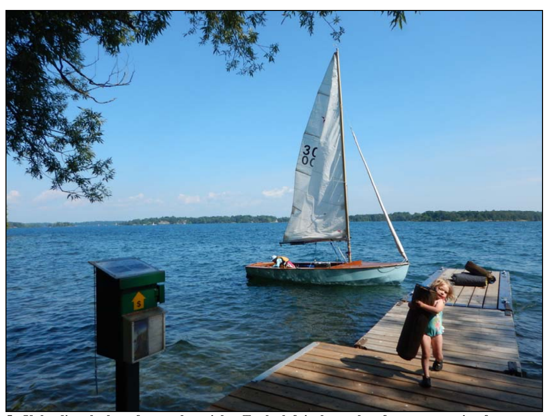
5 - Unloading the boat for another night. To the left is the paybox for your mooring fees.