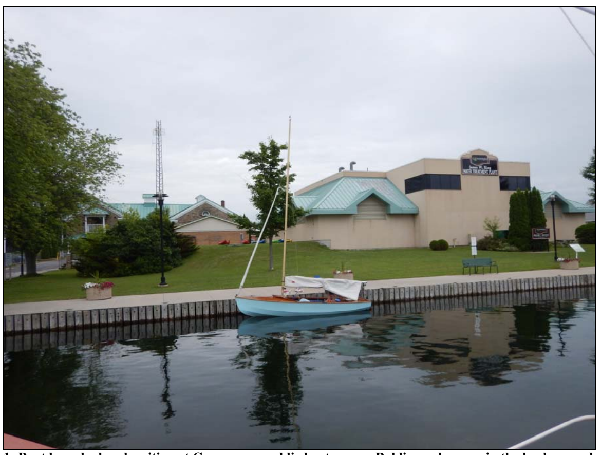
1- Boat launched and waiting at Gananoque public boat ramp. Public washrooms in the background.

The other bonus about launching downtown at the public boat launch was there is a big park and public washrooms. For people waiting around, there is lots to do, especially for kids like a play structure, beach and plenty of grass to run around.