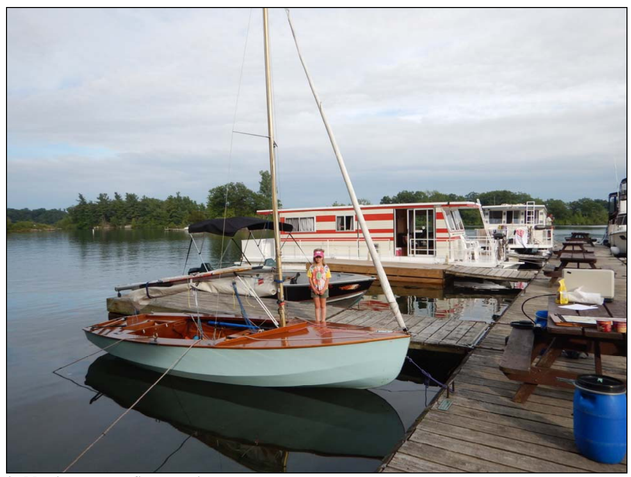
2 - Mooring up at our first campsite.

We set sail out and tacking out of harbour (ie. marina). It was easy because there is lots of room to tack. Although there is tons of motor boat traffic and one should never assume that powerboaters know that a sailboat has right way and so we played it conservative.