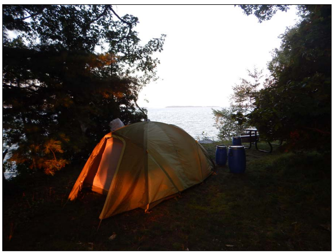
6 - Waking up for another beautiful day of sailing. Gordon Island Campsite no.3 (highly recommended)