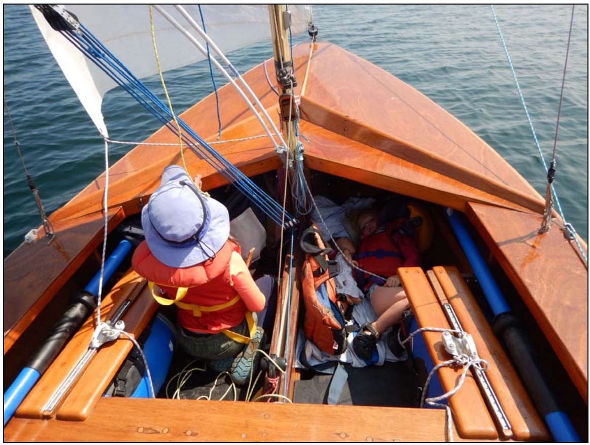
3 - How we spent our day!

We did not come to the 1000 Islands to camp but to sail. We had 20 km winds for the three days that were there. Wind was never a problem. The mornings were light but by the afternoon, we had some quality sailing. I think one downwind run was close to an hour in duration. Big smiles all around.....and maybe a nap as well. Norah, my youngest daughter loves napping in the Wayfarer and we can tuck her in and make her comfortable.